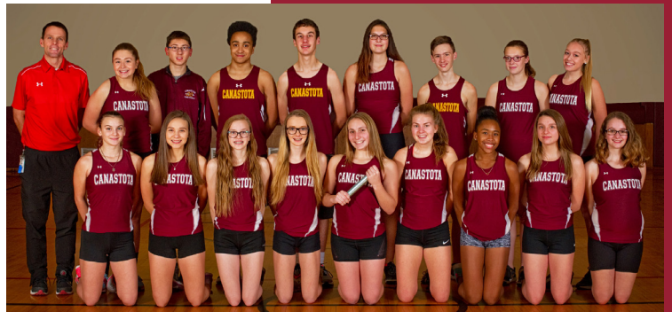
Track and Field