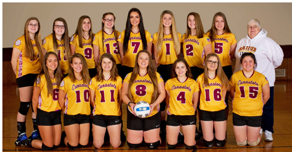
Girls Varsity Volleyball