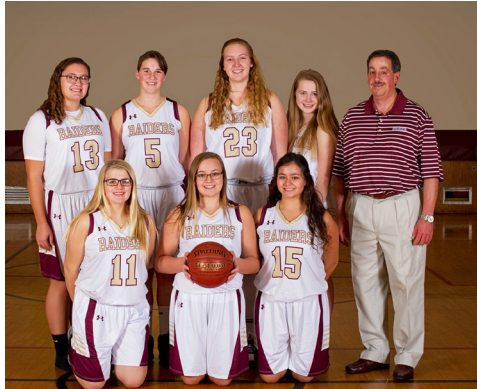
Girls Varsity Basketball