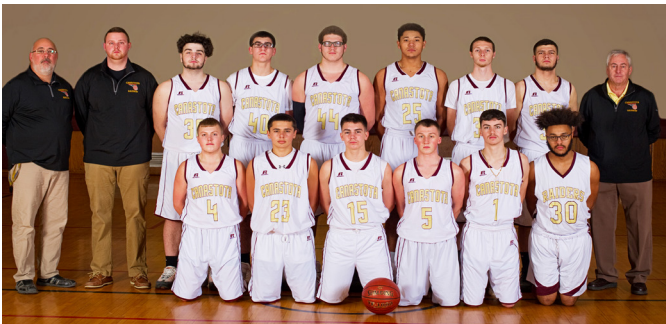
Boys Varsity Basketball